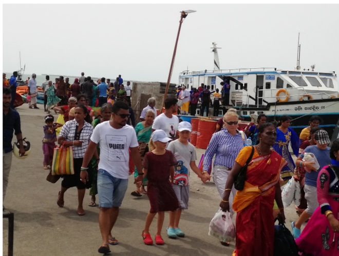
Fig. 3. Southern domestic tourists walking to the Nagadeepa Purana Vihara from the Jetty.

area of Sri Lanka, it must be a compulsory item of your itinerary [sic]" (NAG6). Similarly, Nallur Hindu Temple is a highly recommended cultural attraction in Jaffna. "When visiting Jaffna, Nallur temple is a must. Beautiful interior and a good experience" (NAL12). Out of many colonial sites in Jaffna, Dutch Fort stands tall. One traveler comments: "This is one of the main attractions in Jaffna. This historical fort was built by Portuguese about 3 centuries ago" (FORT7).