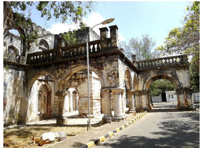
Fig. 1. War blew Jaffna Dutch Kachcheri Building with a few numbers of visitors.

Many websites have generated different platforms for travelers to consult and review, including TripAdvisor.com , Yelp.com , Citysearch.com , and Virtualtour.com . Such online platforms have enabled tourists to freely comment or review various tourism service providers, attractions, activities, infrastructure, and experiences, subject to the